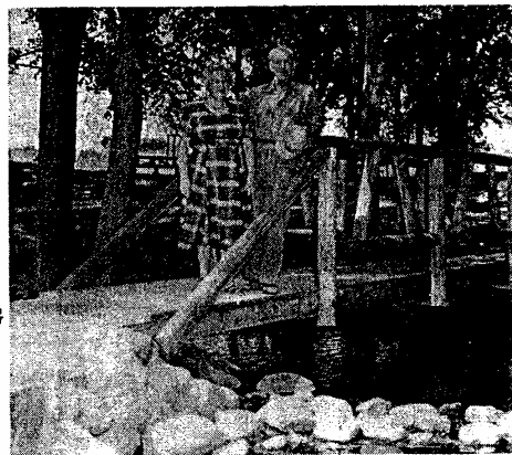
Early Columbia Creek Park Picture

The same year the Aurelius 4-H Club and their leaders with extra manpower planted 500 red and white pine seedlings. These were planted on the East side of the roadway leading to the "DUMP". These trees now reach nearly 30 feet in height and a thick carpet of needles cushion ones footsteps when walking through the pines. To finalize the Aurelius Garden Club contribution to the park, a shelter was built by men in the neighborhood. The Town Board became interested in maintaining the park. They also planted a hedge row and numerous deciduous trees for a bird sanctuary at the back of the property. Recently land adjoining the park was purchased to enlarge the park. Much work has been done and it has greatly improved the beauty of the park. Township monies are used to maintain the park. Aurelius Township is fortunate to have a park, as many of the other townships in the County, do not have a natural site for a beautiful rural park.